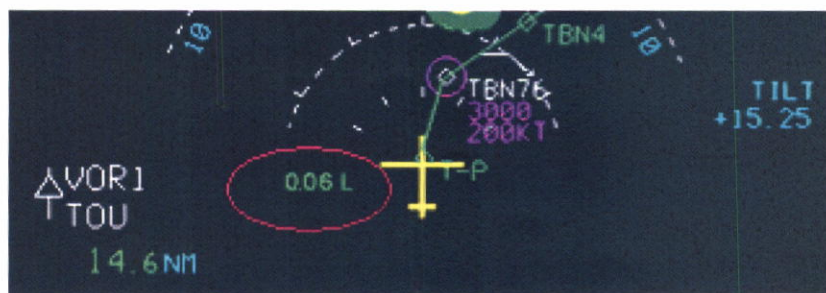
Figure 10.2: Lateral deviation displayed on a navigation (map) display